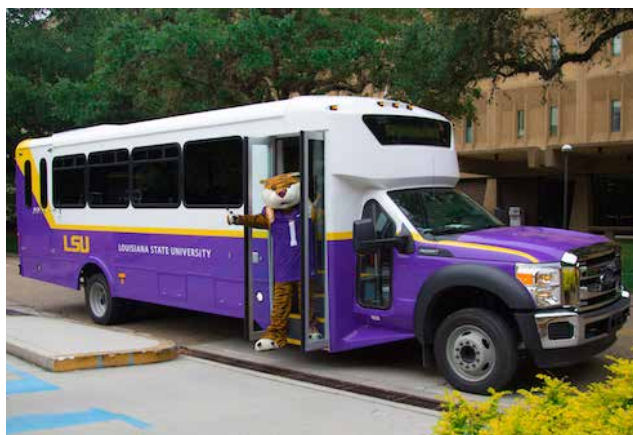
Campus Transit service provides door-to-door service seven days a week, 5 p.m.–midnight, to and from any location on campus.

Campus Transit is available on demand. On-demand rides are scheduled from within the TransLōc Rider app. When you're viewing the LSU TransLōc service, an icon will appear in the bottom left corner of the map. When the "On Demand" icon is blue, on-demand service is available, and clicking the icon will allow you to schedule an on-demand ride. When the icon is gray, on-demand service is unavailable (in other words, it's out of service). Clicking this icon will display information about the on-demand service. In the event of "On Demand" being out of service, please call 225-578-5555.