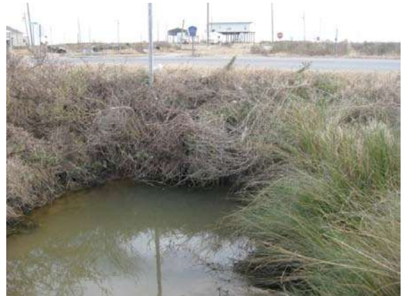
Figure 4. Bacterial source for the Holly beach in the Calcasieu River Basin.