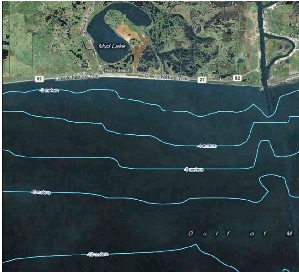
Figure 3. Bathymetry at Holly Beach, Louisiana