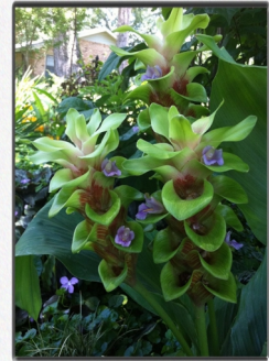
Choco Zebra Curcuma