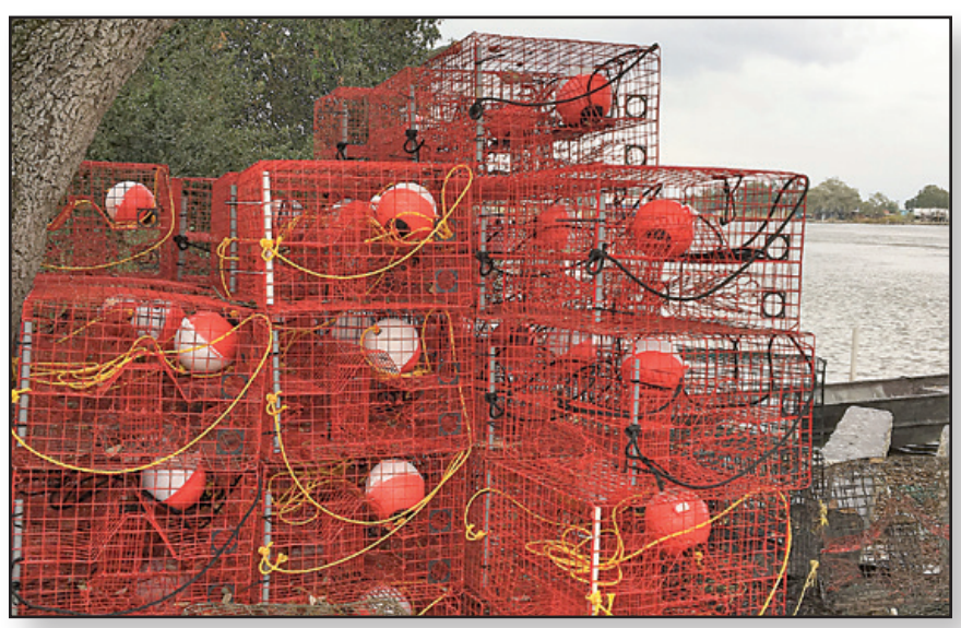
Crab traps.

{\it https://fs30. formsite.com/J froeba/form84/index. html}