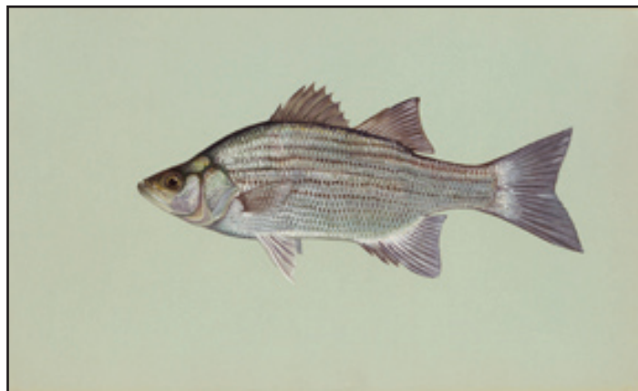
White Bass Image credit: Duane Raver, U.S. Fish and Wildlife Service

also commonly referred to as “barfish.” They have silvery to white coloration, with six to nine narrow stripes, sometimes interrupted below the lateral line. The characteristic that most clearly separates white bass from yellow bass is the separation of the spiny and soft portions of the dorsal fin (versus connected by a membrane in yellow bass). White bass are often found in moderately clear waters of large streams, lakes, and reservoirs over firm sand, gravel and rocks. They often school in open waters, feeding primarily on fish, insects and crustaceans, which are located by sight rather than scent. White bass are important sport fish and can be caught with minnows and minnow-imitating lures (white or silver jigs, spoons, rattling plugs). They are a bit more strongly-flavored than most other panfish. White bass also migrate in the spring from the large rivers up into smaller streams for spawning.