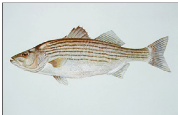
Striped Bass Image credit: Duane Raver, U.S. Fish and Wildlife Service

Striped bass ( Morone saxatilis ) are the largest of the temperate basses. The state record is a 47.5-pound fish caught in Toledo Bend (James Taylor - 1991) and the world record is a 78.8-pound, 53-inch, 20-22 year old behemoth caught off the New Jersey coast. Striped bass anglers often argue that these are the hardest-fighting fish that swim. Striped bass are more fusiform (torpedo-shaped) than the other temperate basses, with silvery sides, and six to nine uninterrupted stripes on the upper side.