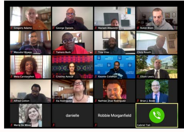
Contributors to Teaching Race: Struggles, Strategies and Scholarship in the Mass Communication Classroom held a virtual meeting Oct. 2, 2020 to begin work on the book scheduled to be published August 2021.