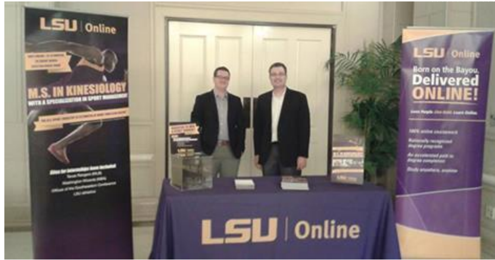
Check out our kiosk at the Applied Sport Management Association Conference, Feb. 25-27!