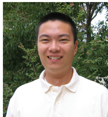
Don't mess with Yunke: Yu mooving to Austin.