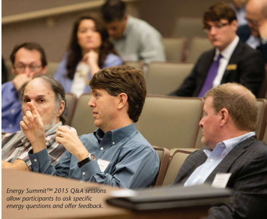
Energy Summit™ 2015 Q&A sessions allow participants to ask specific energy questions and offer feedback.