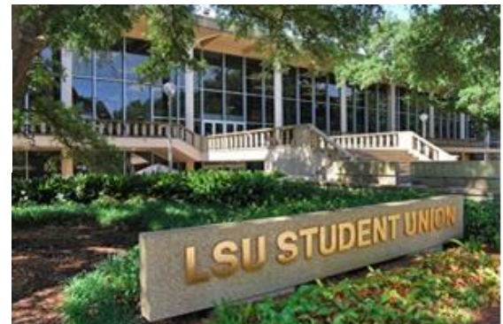
Image: Front of LSU Student Union