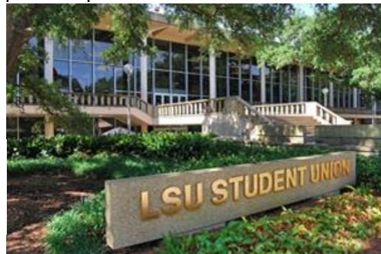
Image: Front of LSU Student Union