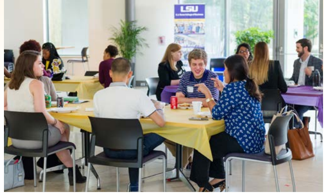
Students and faculty enjoy the reception.