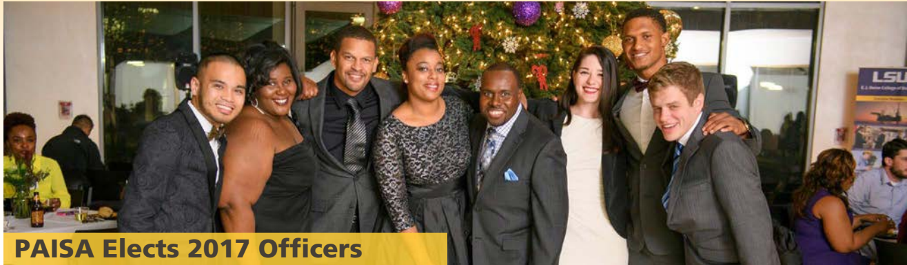
2017 PAISA officers at the honors reception in December.

PAISA, the student organization for PAI, recently elected its 2017 officers. The group serves as a source of support and cohesion among student peers who are pursuing their MPA.