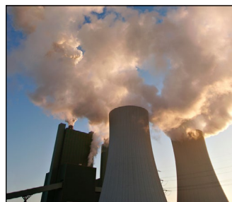
EPFRs form in combustion and thermal processes, including hazardous waste incineration and diesel combustion.

In other studies, Kurt Varner, Ph.D., and his team demonstrated that EPFR exposure reduces heart function and increases the heart's sensitivity to ischemia, a reduction in blood supply to tissues. 4 This study suggests that EPFRs may pose an increased risk to people with cardiovascular disease.