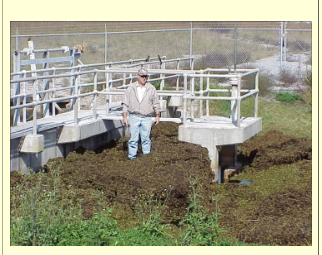
In Cameron Parish, Salvinia built up against the flood control gates in the town of Cameron to a depth of several feet. It formed such a thick mat that this man was able to stand on the floating mass without sinking into the water.

LDWF field crews will soon begin spraying in Cameron and landowners agreed to work together over the long term to control the plant on private property. "If all of the hunters and boaters will also help us by cleaning their boats and trailers after each use, we can control the plant in the parish," Savoie concluded.