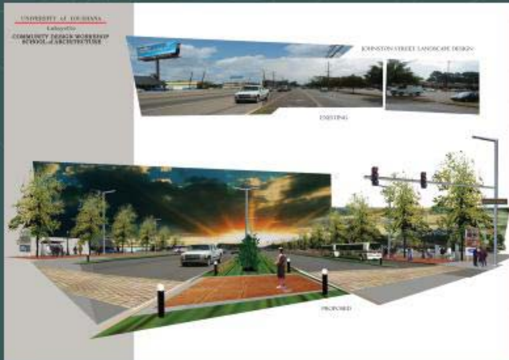
ABOVE: COMPUTER RENDERING OF JOHNSTON STREET PROPOSAL; BEFORE AND AFTER RIGHT: PLAN OF BANK DISTRICT PROPOSAL WITH INFILL BUILDINGS