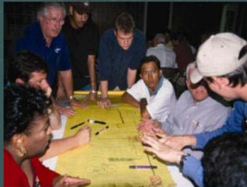
FACULTY, STUDENTS, AND RESIDENTS WORK ON A MASTER PLAN FOR OPELOUSAS