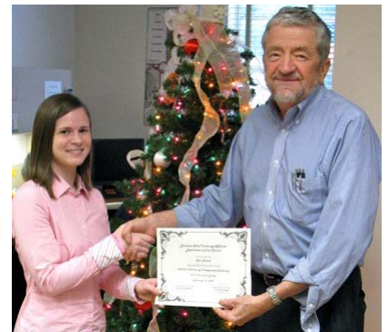
Sara Maxwell McIlhenny, Inc. Scholarship