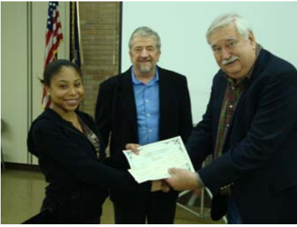
Tracy Heffes Allen Canning Scholarship