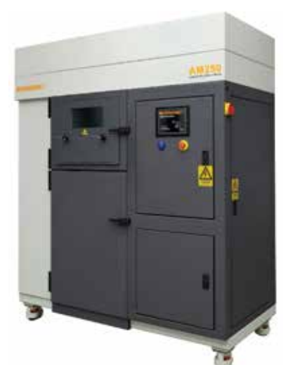
UoD's Renishaw AM250 SLM powder bed fusion machine with modulated fibre laser.

The MTS Nanoindenter XP<sup>®</sup> device with a load resolution of 50 nN and a displacement resolution of 0.01 nm is used to measure the elastic stiffness, hardness, and yield