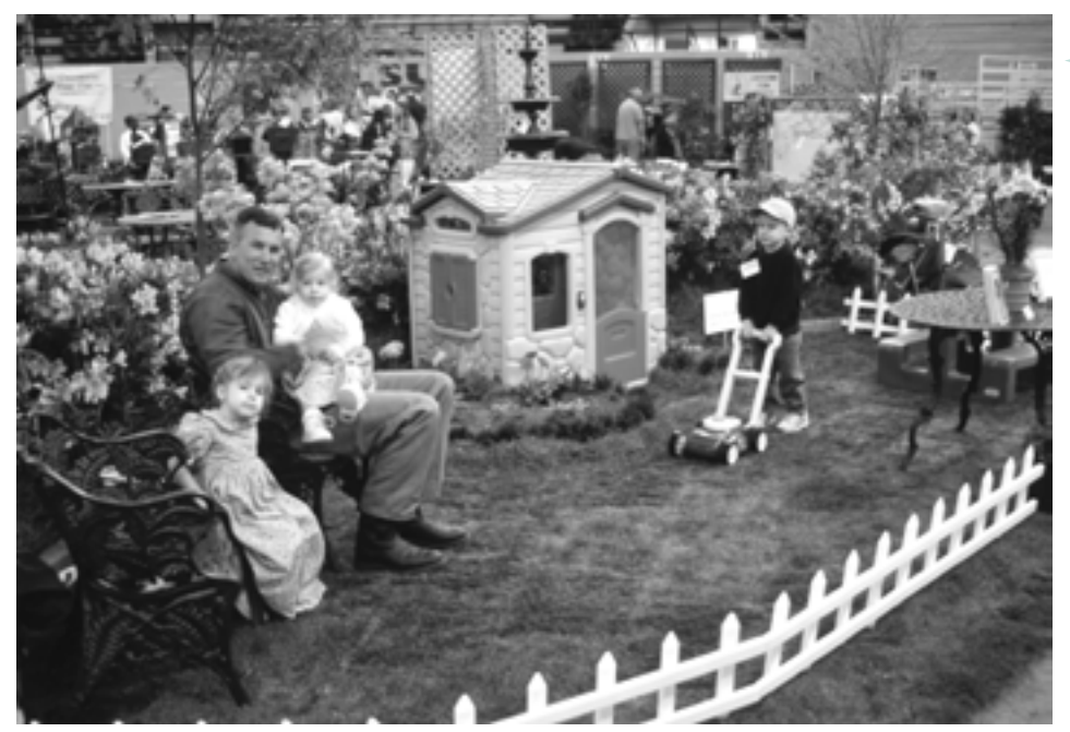
A family enjoys watching a "turf expert" mow the lawn at the Baton Rouge Spring Garden Show.

Non-profit Org. U.S. Postage PAID Permit No. 733 Baton Rouge, LA