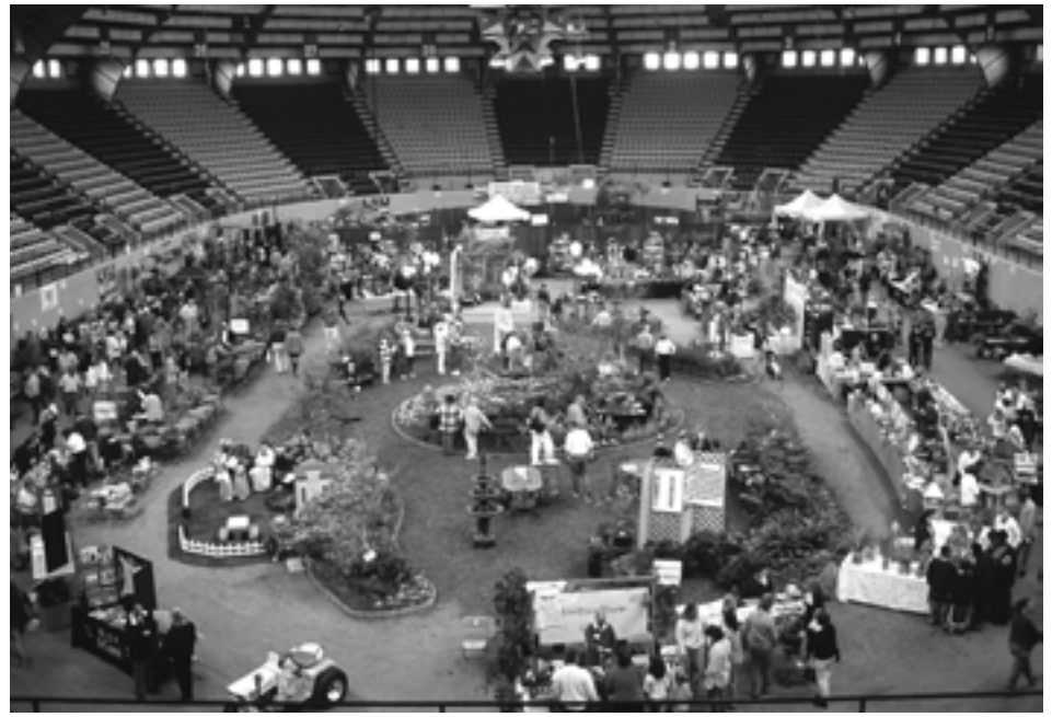
The Spring Garden Show was a success.

tained adults and kids alike. The EBR Parish Master Gardeners assisted with ticket sales and conducted plant health clinics. The LSU Ag Student Council