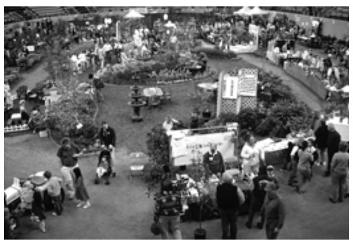
The Horticulture Club (foreground) was among the many vendors at the first Baton Rouge Spring Garden Show.

• The Fall Plant Sale is tentatively scheduled for late October on the corner of Highland Road and South Stadium Drive. Fall bedding plants, garden mums and other plants will be offered.