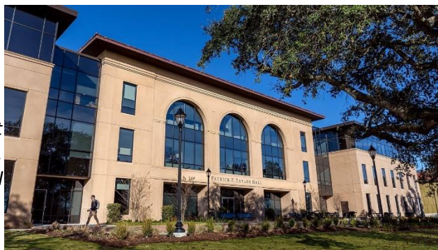
Image: Front of Patrick F. Taylor Hall