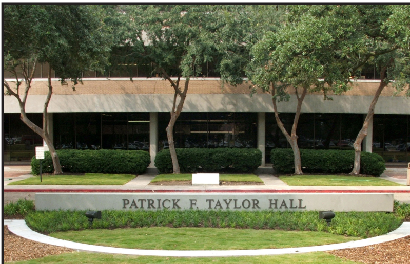
Patrick F. Taylor Hall on Louisiana State University's Campus in Baton Rouge